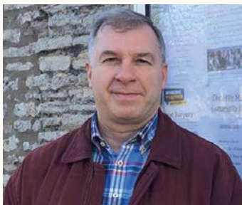
Chair of Planning & Transportation