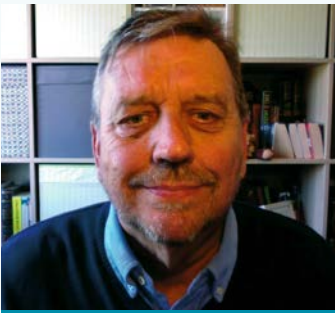
Chair of Recreation and Leisure