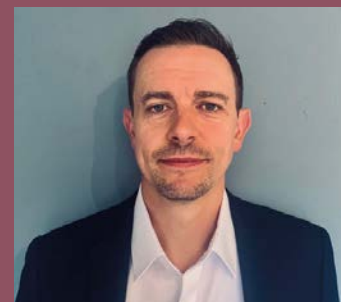
Parish Clerk & Responsible Financial Officer