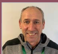
Building Maintenance & Cleansing Operative

Buildings Maintenance & Cleansing Operative.